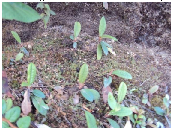
Plate: 1. Regeneration of R. arboreum at 2800 mt.