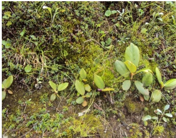
Plate: 3. Regeneration of R. campanulatum at 3400 mt. Plate: 4. Regeneration of R. anthopogon at 3800 mt.