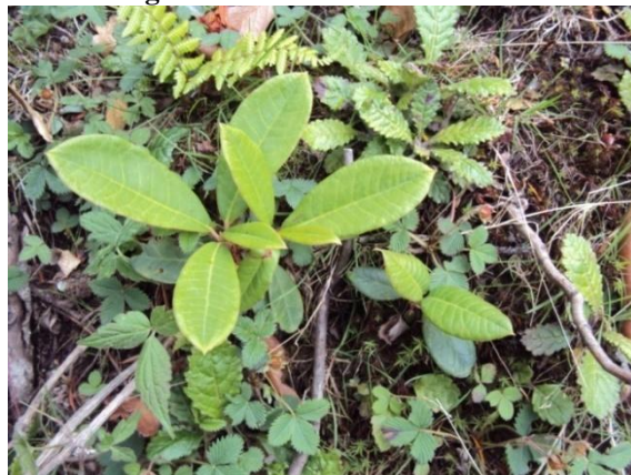
Plate:2. Regeneration of R. barbatum at 2800 mt.