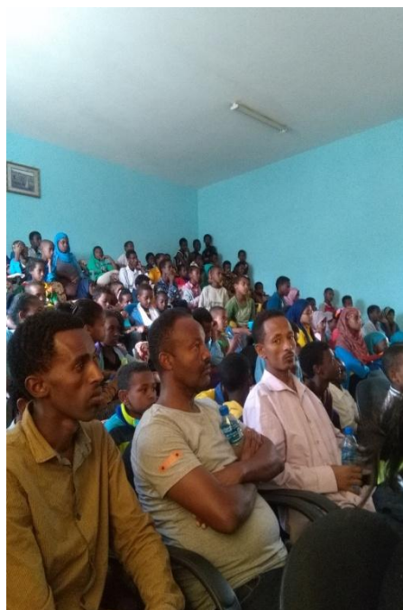
Photo during explanation about the question and its target to students and during students answer the question