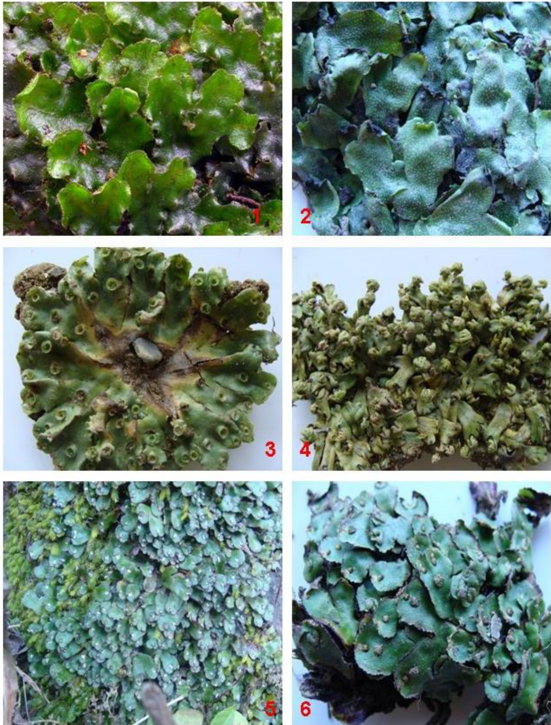
Fig.1 & 2 - Patches of thalii of Dumortiera hirsuta and Conocephalum conicum