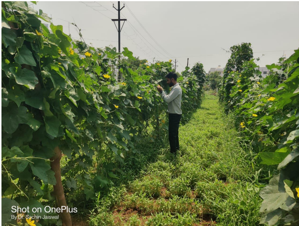
Fig. 2: Observation to be recorded