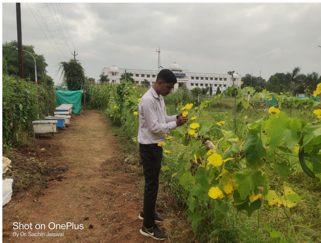
Fig. 1: Experimental field of Sponge guard