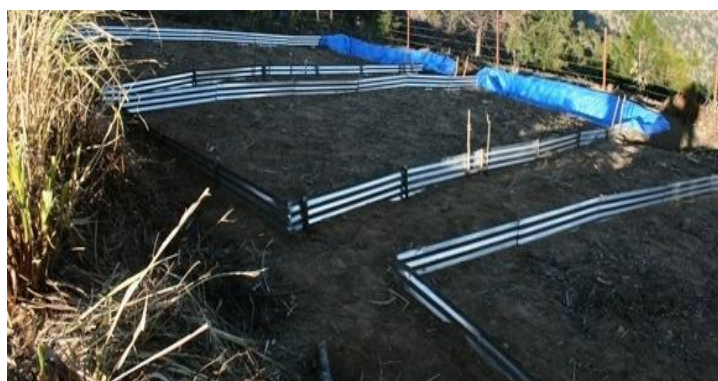
Fig. 2. Runoff plot

Three plots having an equal size of 4.05m × 1m (4.05 m 2 equal to 1/1000 th of 1 acre) with the natural uniform slope of 16.73% was prepared. The original plot size was 22.13m × 1.83 m (equal to 1/100 th of 1 acre, Wischmeier and Smith, 1978).